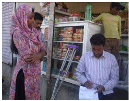
Filling up survey form on the street