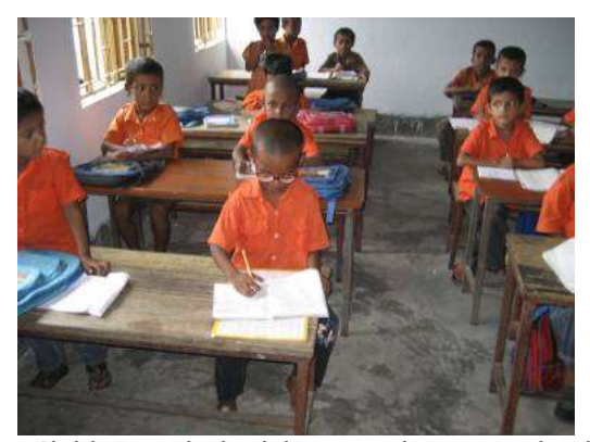
Children with disabilities reading in a school

Goal: "Promoting education rights and inclusion of children with disabilities in to mainstream education system increased" and "An inclusive Employment Environment is created for Persons with Disabilities".