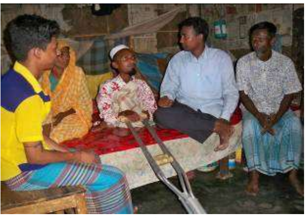
Counseling with Disabled Beggars