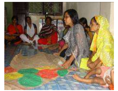
Participants are working in Lokokendra