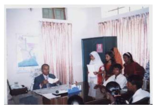
Advocacy Activity to the DD Primary Education, Sylhet