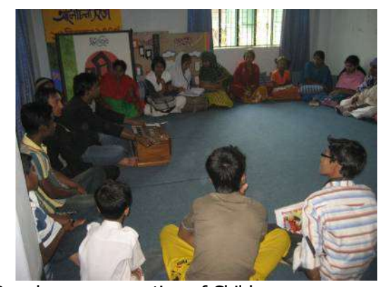
Regular group meeting of Children group