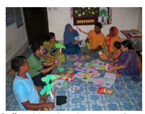
Staff receiving orientation on preparing teaching materials