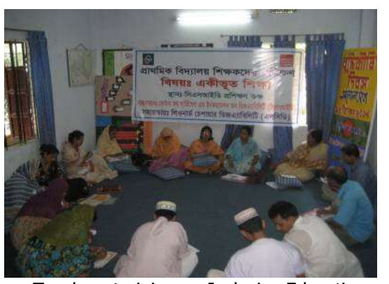
Teachers training on Inclusive Education