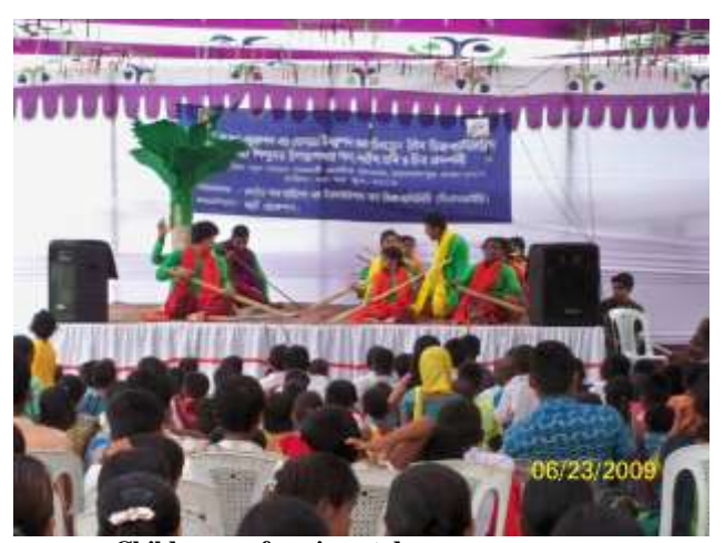
Children performing at drama