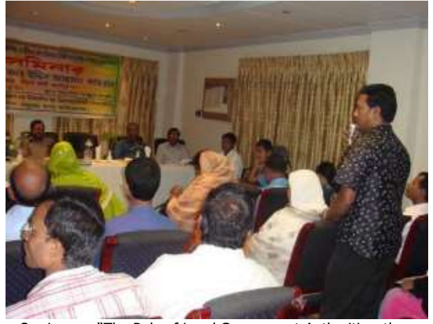
Seminar on "The Role of Local Government Authorities, the Political leaders, Councilors and Mayor" in promoting rights of CWDs