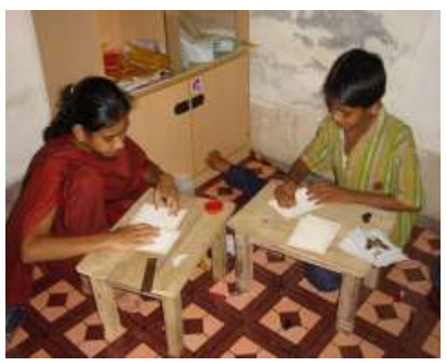
Vocational skill training